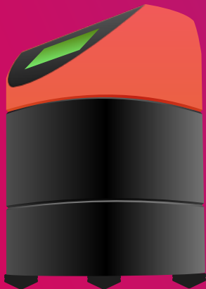
SMA-HR and -XR, TREMOR, PRISM-SP, -MP and -LP

A central hole passing through the entire sensor allows for rapid single hole installation using the included mounting kit. The Blast also includes spikes to replace the removable feet for quick installation in soil.