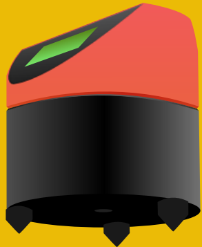
BLAST and SMA

Stream live data using an Ethernet+WiFi adaptor, cellular modem, USB cable, or GeckoLink (SeedLink) server.